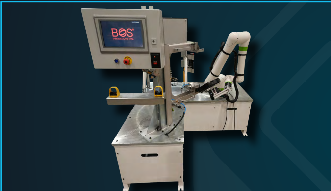
End-Of-Line Inspection Station

TrueLight Machine Vision Integration designs and integrates custom Quality & Gauge Solutions that combine vision inspection, advanced robotics and Proximity Smart Support™ for a fully connected, intelligent inspection ecosystem.